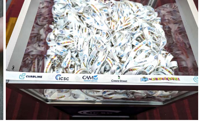
Lanyard Sponsorship $15,000 max 4 sponsors