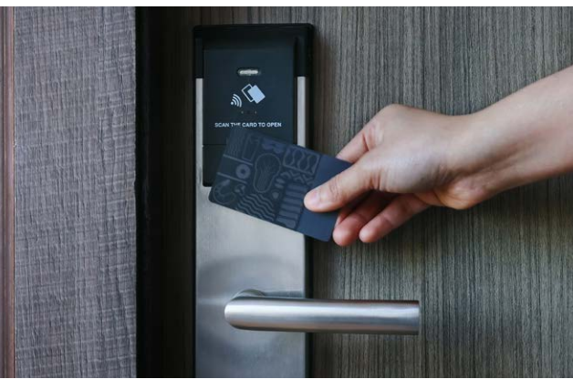
Hotel Key Card Sponsorship Starting at $10,000