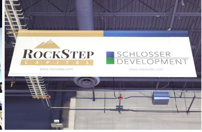
Rectangular Booth Banner $16,500