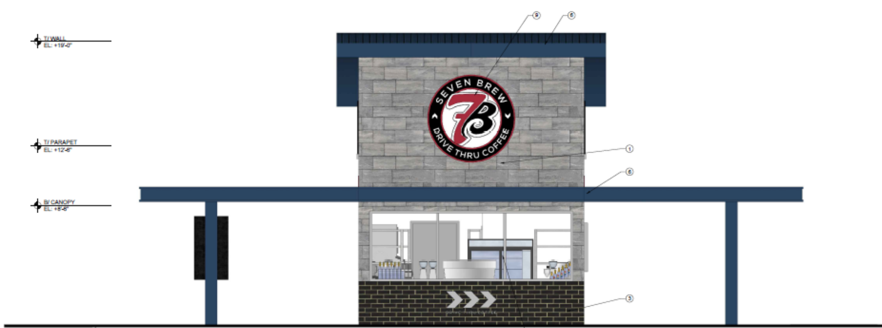
2 FRONT ELEVATION SCALE: 3/16" = 1'-0"