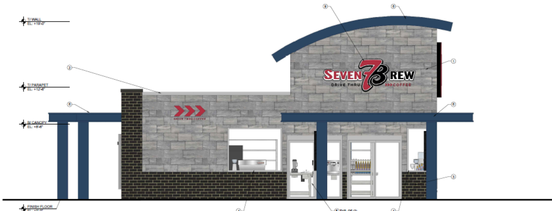
1 RIGHT ELEVATION SCALE: 3/16" = 1'-0"